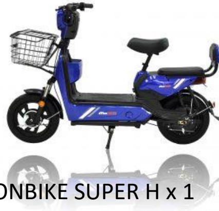
STONBIKE SUPER H x 1