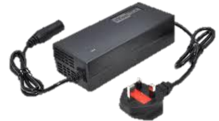
STONBIKE Charger x 1