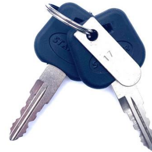
Gear Lock Key x 2