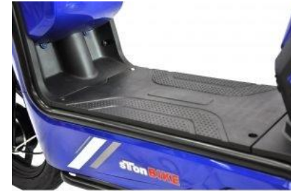
Power Cable Connector

Step 1 : Make sure Power Cable connect properly and battery secure with lock.