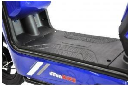
48VDC Lithium Battery x 1