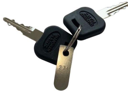
Power Switch Key x 2