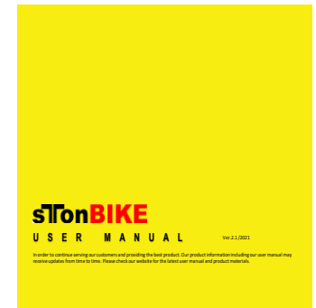
User Manual x 1